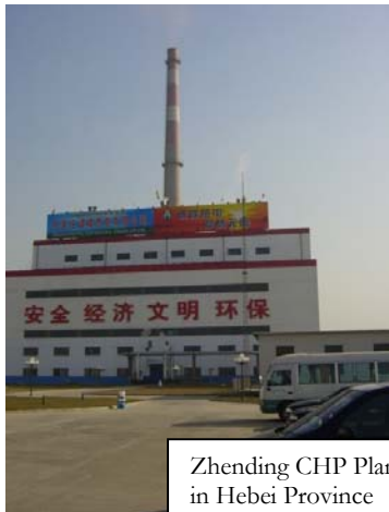
Zhending CHP Plant in Hebei Province